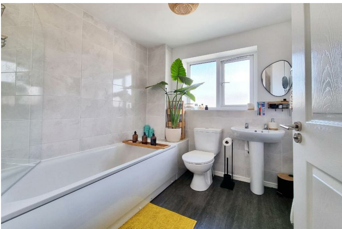
Bathroom 6'11" x 6'9" (2.11m x 2.06m)

PVCu double glazed window to front, skimmed ceiling, LVT flooring, chrome wall mounted heated