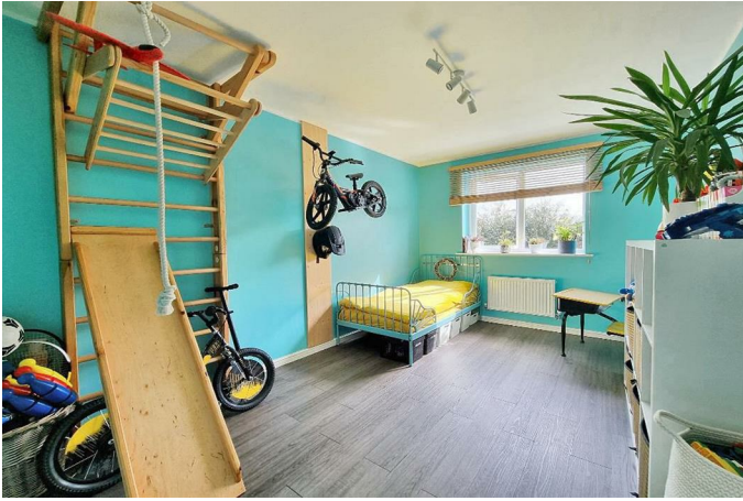
Bedroom Three 10'2" x 7'3" (3.11m x 2.21m)